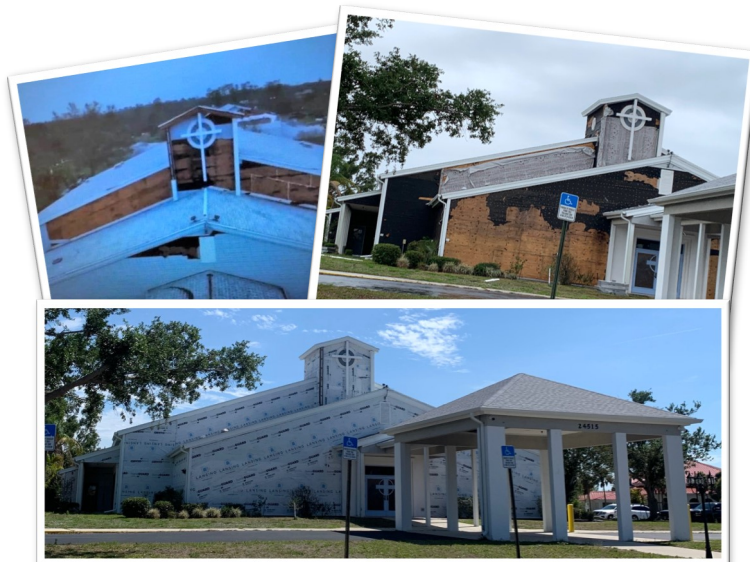
Ready for new siding, April 2023