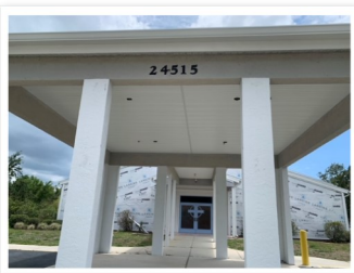
tarped ...vinyl siding removed