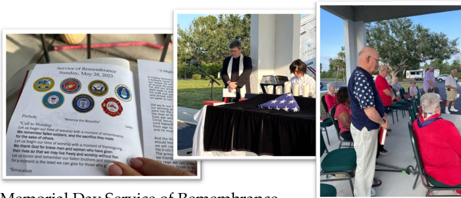
Memorial Day Service of Remembrance

Weathered Crosses Replaced by Building & Grounds Committee