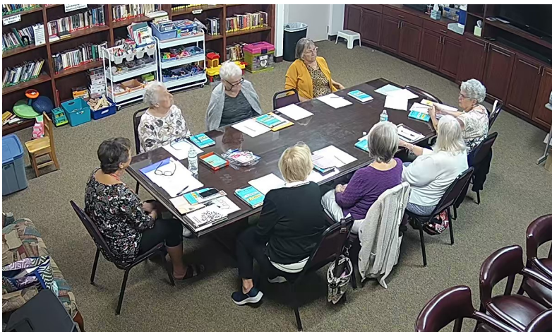
Pilgrim Women's Fellowship

Please know you are appreciated. Your support means more than words can ever say! Thank you from the Board of Directors and the Leadership of the Virginia B. Andes Volunteer Community Clinic.