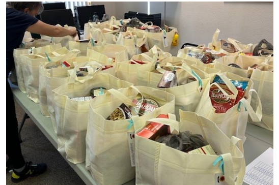
Pilgrim Thanksgiving Baskets