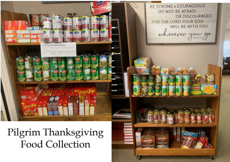
Pilgrim Thanksgiving Food Collection