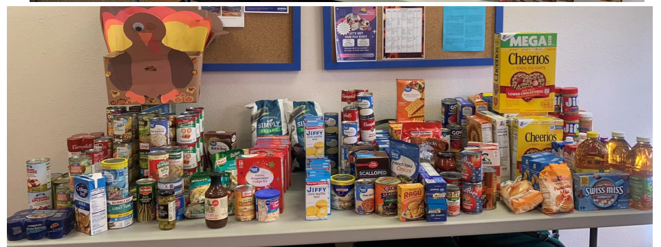
Joyful Noise Food Drive